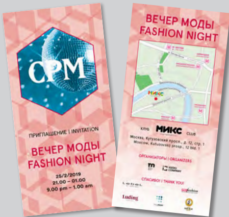
Sample of the Invitation card