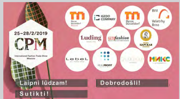
Sample screen of the Welcome-movie

Chief-Organizer: Messe Düsseldorf Moscow OOO, Ulitsa Timura Frunze 3-1, 119021 Moscow, Russia Co-Organizer (named as Organizer): Igedo Company GmbH & Co. KG, Emanuel-Leutze-Straße 8, 40547 Düsseldorf, Germany T +49 (0)211 4396-01, F +49 (0)211 4396-345, cpm@igedo.com