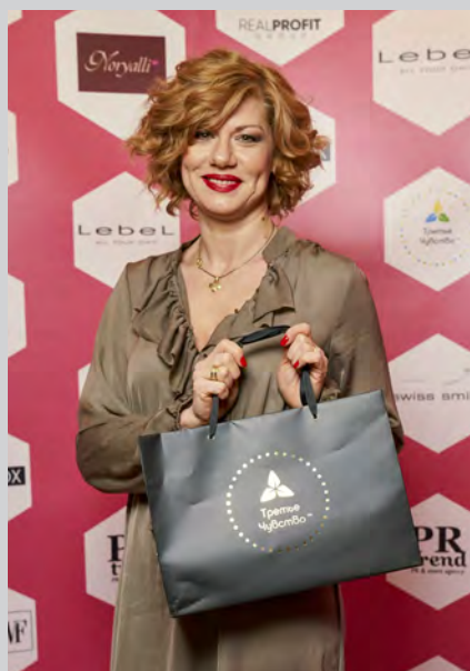
Elena Biryukova – theatre and film actress