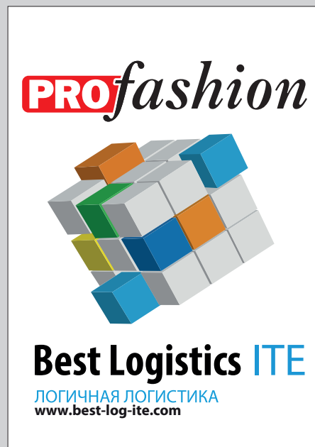
Printable part of the backside

Chief-Organizer: Messe Düsseldorf Moscow OOO, Ulitsa Timura Frunze 3-1, 119021 Moscow, Russia Co-Organizer (named as Organizer): Igedo Company GmbH & Co. KG, Emanuel-Leutze-Straße 8, 40547 Düsseldorf, Germany