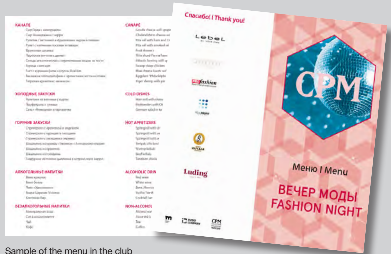
Sample of the menu in the club