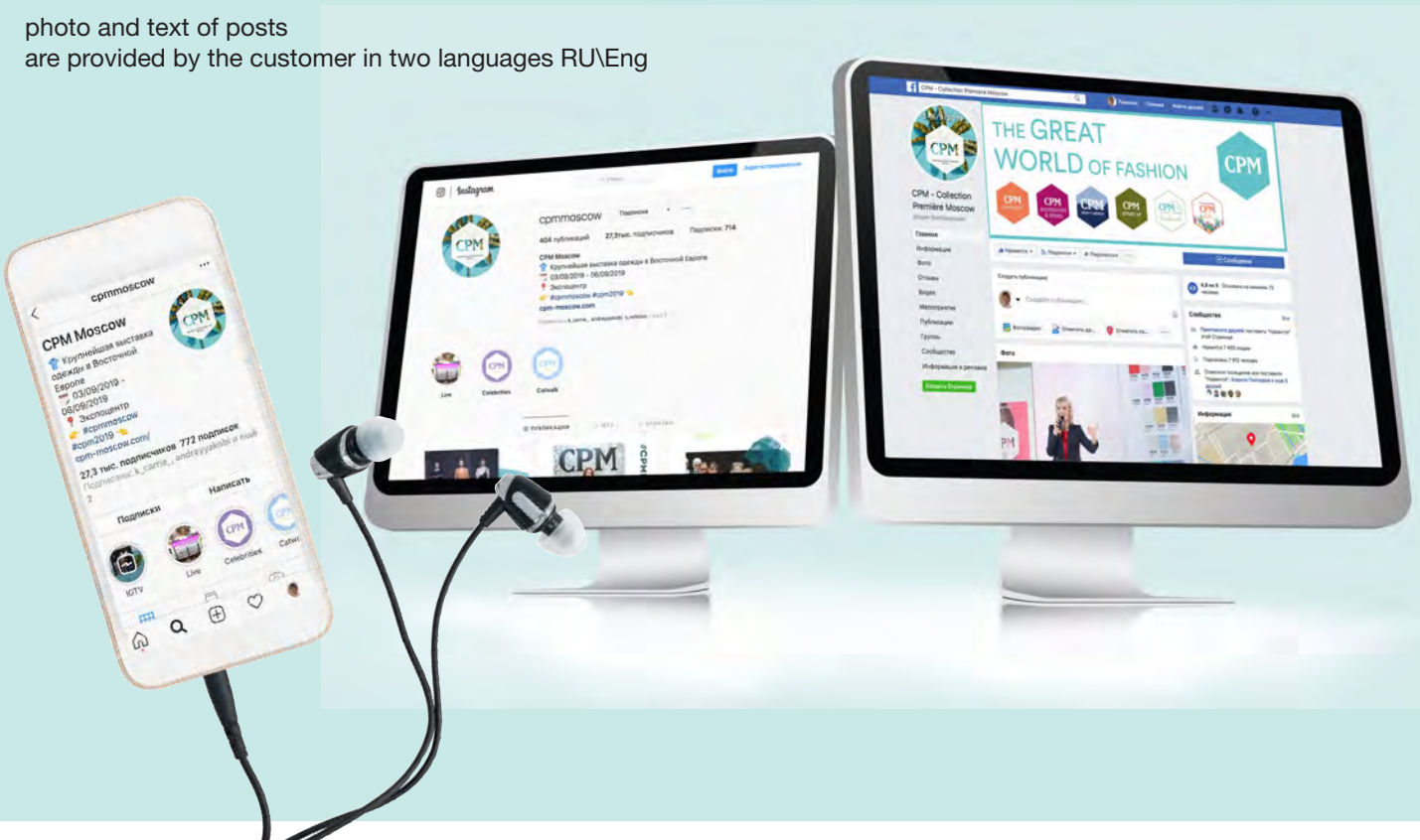
photo and text of posts are provided by the customer in two languages RU/Eng