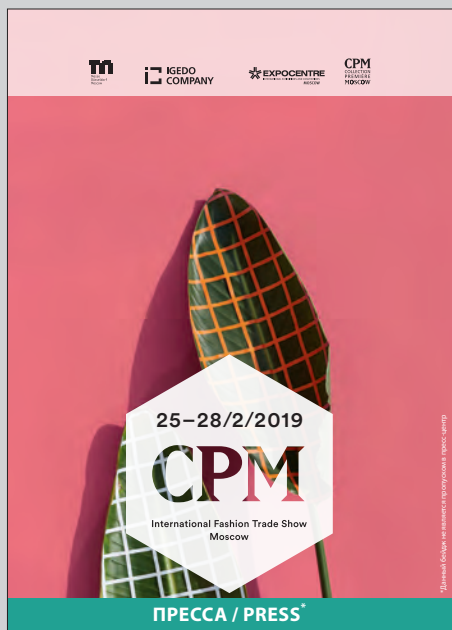
Sample of the frontside