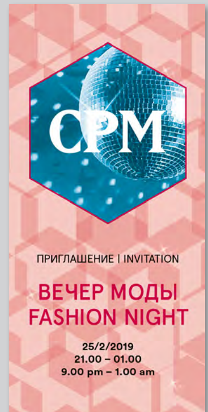
Sample of the ticket

Chief-Organizer: Messe Düsseldorf Moscow OOO, Ulitsa Timura Frunze 3-1, 119021 Moscow, Russia