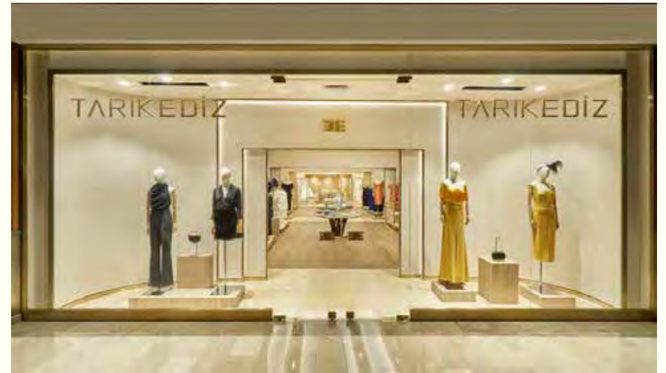
TARIK EDİZ FLAGSHIP STORE, NOW OPEN IN İSTİNYEPARK, İSTANBUL.